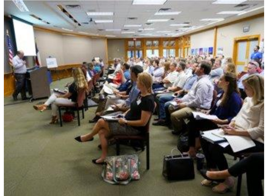
TWDB flood outreach meeting in Bastrop, TX.