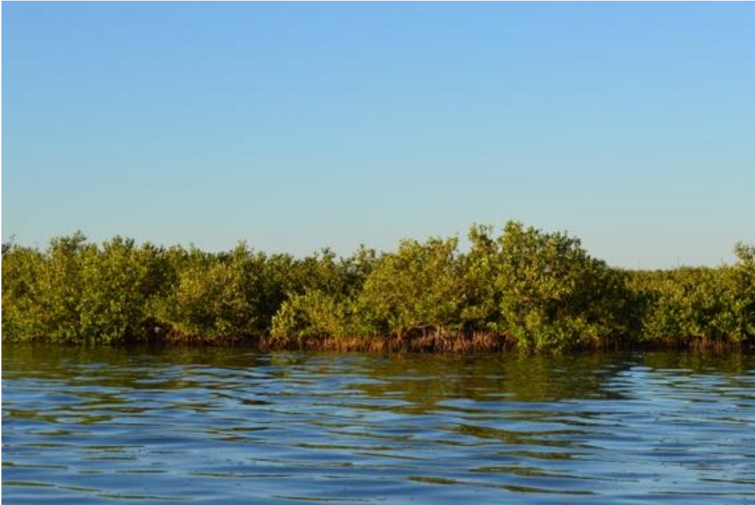
Mangroves on the Texas Coast stabilize shorelines and help absorb storm surge; an example of a non-structural flood mitigation solution.

The implementation of actions, including both structural and non-structural solutions , to reduce flood risk to protect against the loss of life and property.