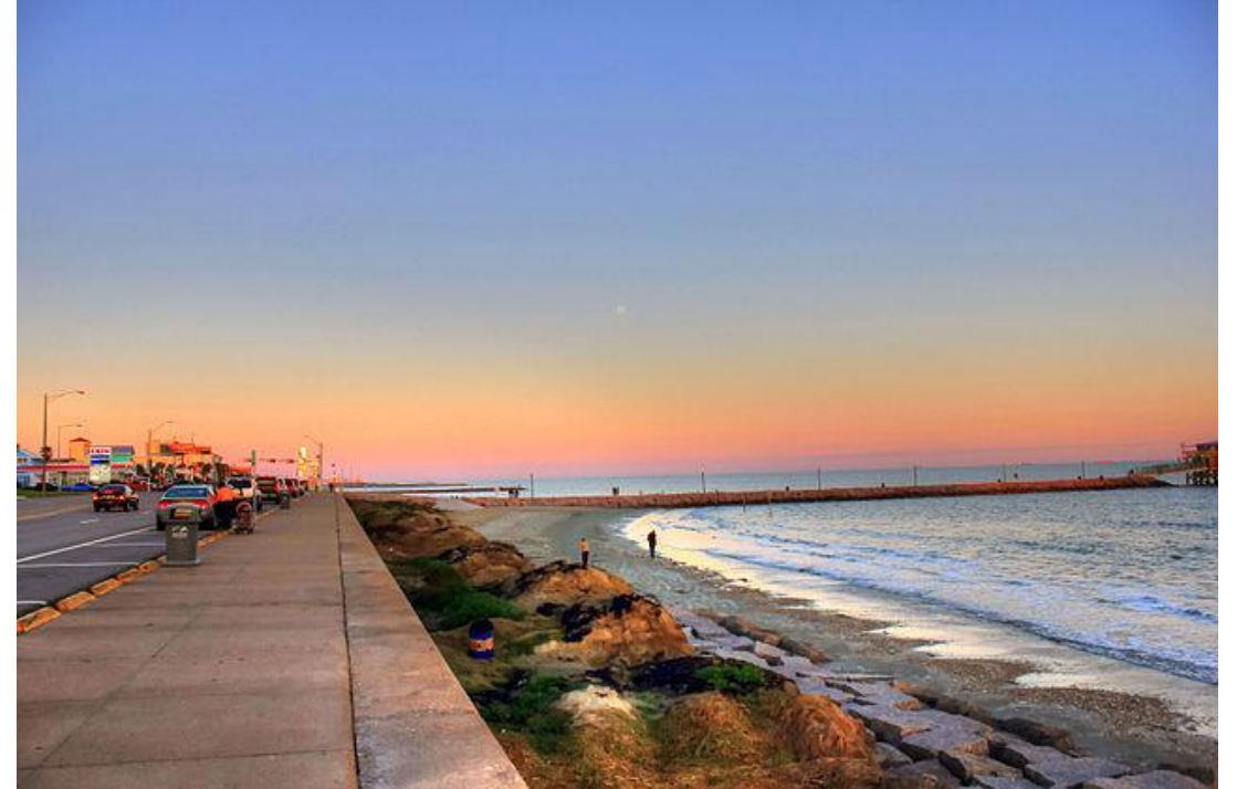
Galveston Seawall, a structural flood mitigation solution.